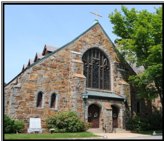
Sacred Heart Church 62 School St. Manchester-by-the-Sea, MA 01944-1342 Established 1905