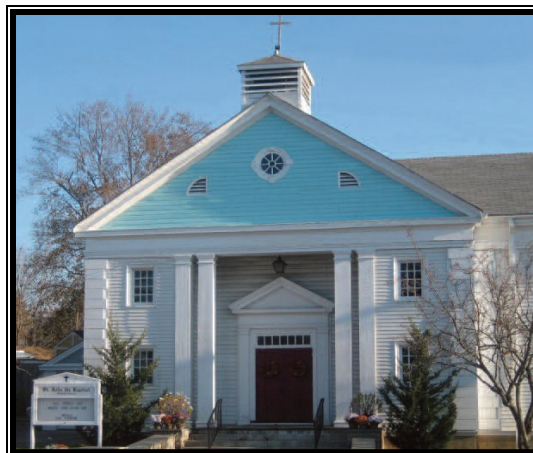
St. John the Baptist Church 52 Main St. Essex, MA 01929-1343 Established 1931

We are here to welcome and serve you. No matter what your present status in the Catholic Church. No matter what your current family or marital situation, No matter your personal history, age, background, race, etc., No matter what your self image— You are invited, welcomed, accepted, loved and respected in Sacred Heart and St. John the Baptist Parishes.